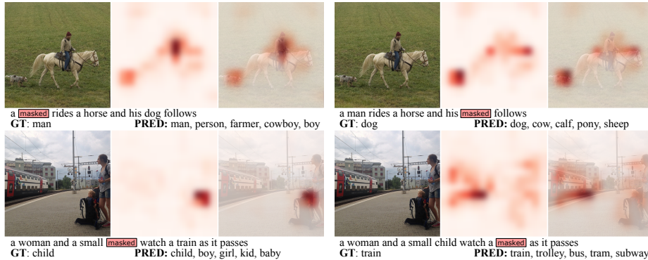
Fig. 1: We introduce image-conditioned masked language modeling (ICMLM), a proxy task to learn visual representations from scratch given image-caption pairs. This task masks tokens in captions and predicts them by fusing visual and textual cues. The figure shows how the visual attention changes as we mask different tokens in a caption (produced by our ICMLM tfm trained on COCO).

Abstract. Pretraining general-purpose visual features has become a crucial part of tackling many computer vision tasks. While one can learn such features on the extensively-annotated ImageNet dataset, recent approaches have looked at ways to allow for noisy, fewer, or even no annotations to perform such pretraining. Starting from the observation that captioned images are easily crawlable, we argue that this overlooked source of information can be exploited to supervise the training of visual representations. To do so, motivated by the recent progresses in language models, we introduce image-conditioned masked language modeling (ICMLM) – a proxy task to learn visual representations over image-caption pairs. ICMLM consists in predicting masked words in captions by relying on visual cues. To tackle this task, we propose hybrid models, with dedicated visual and textual encoders, and we show that the visual representations learned as a by-product of solving this task transfer well to a variety of target tasks. Our experiments confirm that image captions can be leveraged to inject global and localized semantic information into visual representations. Project website: https://europe.naverlabs.com/ICMLM .