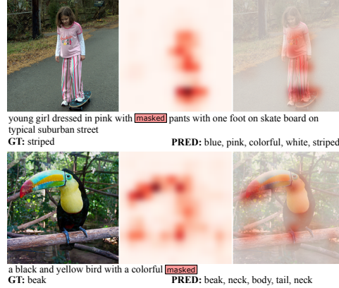
Fig. 3: Attention maps for masked tokens produced by ICMLM t fm model with ResNet50 backbone trained on COCO (darker red means stronger attention).