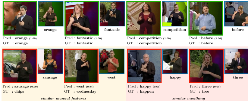
Fig. 3. Qualitative analysis: We present results of our sign recognition model on BSL-1K for success (top) and failure (bottom) cases, together with their confidence scores in parentheses. To the right of each example, we show a random training sample for the predicted sign (in small). We observe that failure modes are commonly due to high visual similarity in the gesture (bottom-left) and mouthing (bottom-right).