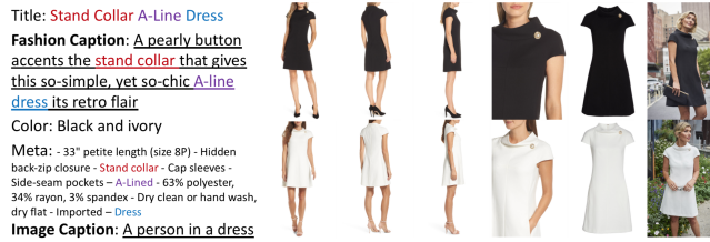
Fig. 1: An example for Fashion Captioning. The images are of different perspectives, colors and scenarios (shop-street). Other information contained include a title, a description (caption) from a fashion expert, the color info and the meta info. Words in color denotes the attributes used in sentence.

of descriptions is in urgent need. Since there exist no studies on generating fashion related descriptions, in this paper, we propose specific schemes on Fashion Captioning . Our design is built upon our newly created FASHION CAPTIONING Dataset (FACAD), the first fashion captioning dataset consisting of over 993K images and 130K descriptions with massive attributes and categories. Compared with general image captioning datasets (e.g. MS COCO [4]), the descriptions of fashion items have three unique features (as can be seen from Fig. 1), which makes the automatic generation of captions a challenging task. First, fashion captioning needs to describe the fine-grained attributes of a single item, while image captioning generally narrates the objects and their relations in the image (e.g., a person in a dress). Second, the expressions to describe the clothes tend to be long so as to present the rich attributes of fashion items. The average length of captions in FACAD is 21 words while a sentence in the MS COCO caption dataset contains 10.4 words in average. Third, FACAD has a more enchanting expression style than MS COCO to arouse greater customer interests. Sentences like “pearly”, “so-simple yet so-chic”, “retro flair” are more attractive than the plain or “undecorated” MS COCO descriptions.