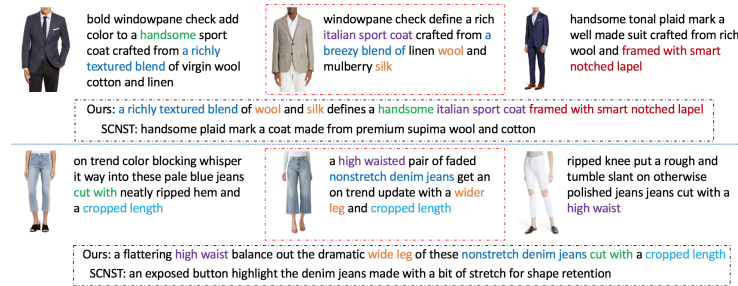
Fig. 4: Two qualitative results of SRFC compared with the groundtruth and SCNST. Two target items and their corresponding groundtruth are shown in the red dash-dotted boxes in the middle column. The black dash-dotted boxes contain the captions generated by our model and SCNST. Our model diversely learns different expressions from the other items (on the first and third columns) to describe the target item.

framed with smart notched lapel (right column) from the second item to make a new description for the target image. The second observation is that our model can enrich description generation by focusing on the attributes identified even if they are not presented in the groundtruth caption. Even though the notched lapel is not described by the ground-truth caption, our model correctly discovers this attribute and generates framed with smart notched lapel for it. This is because that notched lapel is a frequently referred attribute for items of the category coat , and this attribute appears in 11.4% descriptions. Similar phenomena can be found for the second result. The capability of extracting the correct attributes owes to the Attribute Embedding Learning and ALS modules. The SLS can help our model generate diverse captions by referring to those from other items with the same category and similar attributes.