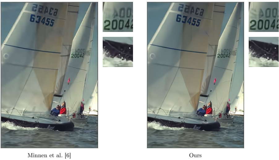
0.1328bpp, 31.81dB, 0.9550