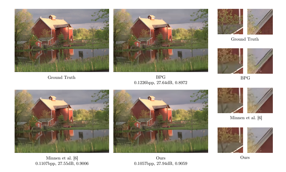
Fig. S2. Additional qualitative comparison results of the traditional codes BPG [3], the neural image compression method Minnen et al. [6] and our proposed methods.

We provide more qualitative comparison results to demonstrate that our methods can adapt to the image content in order to preserve more details with smaller bit-rate in Fig. S2 and Fig. S3. In Fig. S2, we observe that the details of the plants are more clear in our methods. In Fig. S3, it is observed that the shallow letters on the sail of the right boat reconstructed by our methods are clearer than those reconstructed by BPG or [6] and our methods also preserve more details for the waves raised by the left boat than other two methods.