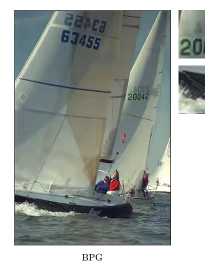
0.1175bpp, 30.90dB, 0.9421