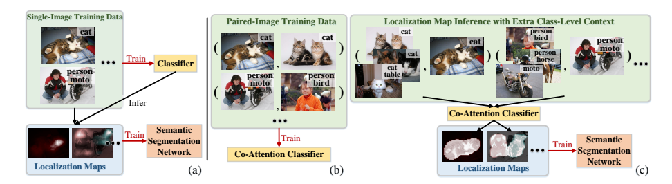
Fig. 1. (a) Current WSSS methods only use single-image information for object pattern discovering. (b-c) Our co-attention classifier leverages cross-image semantics as class-level context to benefit object pattern learning and localization map inference.

etc. Among them, a prominent and appealing trend is using only image-level labels to achieve weakly supervised semantic segmentation (WSSS), which demands the least annotation efforts and is followed in this work.