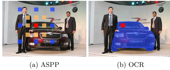
Fig. 2: Illustrating the multi-scale context with the ASPP as an example and the OCR context for the pixel marked with \blacksquare . (a) ASPP: The context is a set of sparsely sampled pixels marked with \blacksquare , \blacksquare . The pixels with different colors correspond to different dilation rates. Those pixels are distributed in both the object region and the background region. (b) Our OCR: The context is expected to be a set of pixels lying in the object (marked with color blue). The image is chosen from ADE20K.

representations, while the relation in previous works is only computed from the pixel representation.