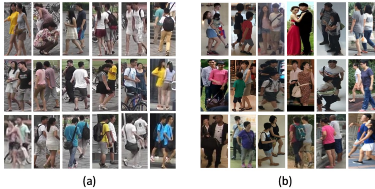
Fig. 1. Examples in PI-PRW (a) and PI-CUHK-SYSU (b).