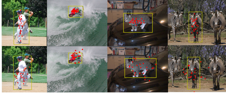
Fig. 3. MimicDet(top) vs. MimicDet w/o head-mimicking mechanism(bottom). Yellow box is the adjusted anchor box generated by refinement module. It’s corresponding deformable convolution locations are denoted by red dots.

feature to a high dimensional feature space, and the third layer performs the final prediction. For simplicity, we keep second and third layer as 1 \times 1 conv layer unchanged and explore the design of the alignment layer.