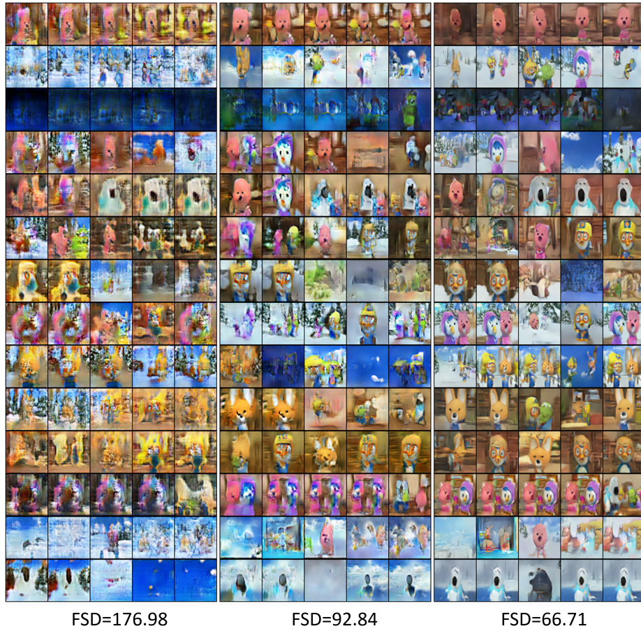
Fig. 9: The generated samples of CP-CSV on Pororo-SV test dataset under different training epochs. The FSD scores are 176.98, 92.84, 66.71, from left to right.