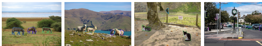
Fig. 1. Visualization of SOLO for instance contour detection . The model is trained on COCO train2017 dataset with ResNet-50-FPN. Each instance contour is shown in a different color.

Our framework can easily be extended to instance contour detection. We first convert the ground-truth masks in MS COCO into instance contours using OpenCV’s findContours function, and then use the binary contours to optimize the mask branch in parallel with the semantic category branch. Here we use Focal Loss to optimize the contour detection, other settings are the same with the instance segmentation baseline. Figure 1 shows some contour detection examples generated by our model. We provide these results as a proof of concept that SOLO can be used in contour detection.