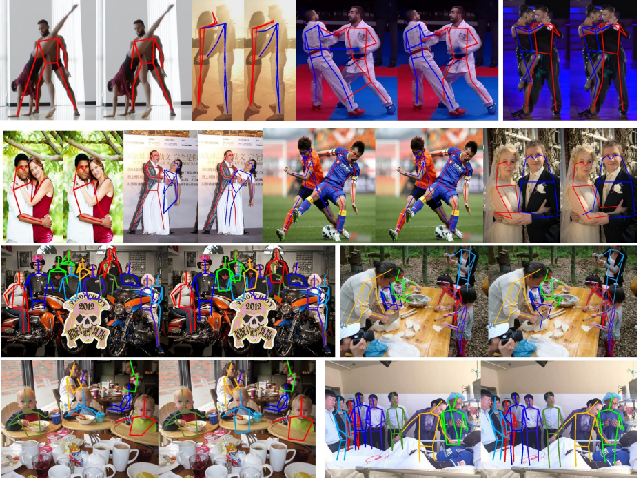
Fig. 4. The results on OCPose, OCHuman and CrowdPose. These are the qualitative comparison results of AlphaPose+ method and OPEC-Net on our datasets. The left pose is estimated by AlphaPose+ method and the right one is ours. The first row is OCPose and the second row represents OCHuman, the rest represents CrowdPose

2.0 mAP@0.5:0.95 improvement compared to the AlphaPose+. Despite of that, a significant 1.0 AP^{90} improvement has been achieved which proves that our OPEC-Net has great ability of inference especially for high level occlusions compared to localization methods. In conclusion, these results validate the prominent effectiveness of our OPEC-Net module on MPPE tasks.