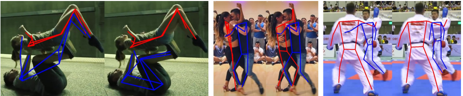
Fig. 3. The qualitative evaluation of CoupleGraph and OPEC-Net. The left images are generated from OPEC-Net and the right ones come from CoupleGraph

Baselines. For comparison, we assess the performance with our OPEC-Net module using the three state-of-the-art approaches for MPPE: Mask RCNN [9], AlphaPose+ 1 [13] and SimplePose [25]. For a fair comparison, we quote the results of Mask RCNN and SimplePose directly from paper [13] and re-train AlphaPose+ from their public code. For the evaluation on OCPose, CrowdPose and OCHuman, we take AlphaPose+ for the initial pose estimation stage with ResNet-101 as the backbone and Yolo V3 as the detector. For the MSCOCO dataset, we take the public code of SimplePose 2 for the first stage because it has a higher performance than AlphaPose+ on MSCOCO. Mask RCNN is used as the detector and ResNet-152 is used as the backbone on MSCOCO. OPEC-Net here denotes the framework with a single person as graph, and CoupleGraph denotes the baseline that performs a CoupleGraph based framework after OPEC-Net. All of details about CoupleGraph is illustrated in supplementary.