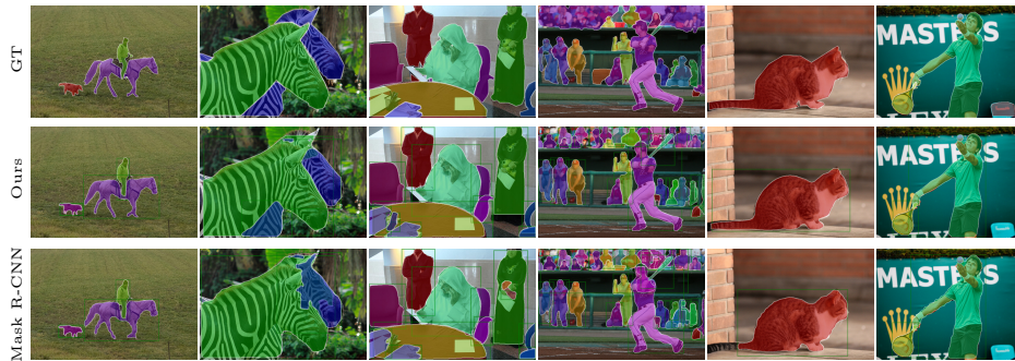
Fig. 3. We showcase qualitative instance segmentation results of our model on the COCO validation set.

Higher Resolution Mask R-CNN: We evaluate whether we could improve the performance of Mask R-CNN by just increasing the resolution of the mask head. We train Mask R-CNN on Cityscapes with ResNet-50 backbone at 112x112 resolution which is the same resolution of the Chan-Vese features and our final TSDF \phi_N . Interestingly the performance drops by 2.2 AP from 32.3. We hypothesize that by increasing the resolution, the ratio of non-boundary pixels vs. boundary pixels will become higher and they dominate the loss function gradients leading to worse masks. In our proposed method however, there is a global competition between the foreground/background regions to minimize the energy and hence we are able to increase the resolution.