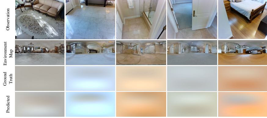
Fig. 6. Irradiance map comparison between ground truth and predicted ones. Row 1 shows the observation captured by mobile camera. Row 2 shows environment map generated from the dataset. Row 3 shows the irradiance map generated from the environment map using spherical harmonics convolution. Row 4 shows the reconstructed irradiance map from SH coefficients predicted by POINTAR.

popular rendering engines such as Unreal Engine support rendering 3D objects directly with SH coefficients.