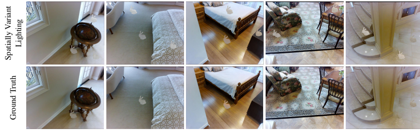
Fig. 1. Rendering examples of PointAR in spatially variant lighting conditions. Row 1 shows the Stanford bunnies that were lit using the spherical harmonics coefficients predicted by POINTAR. Row 2 shows the ground truth rendering results.

AR applications. First, the AR application needs to estimate the lighting at the rendering location, i.e., where the 3D object will be placed, from the camera view captured by the mobile device. Second, as the mobile camera often only has a limited field of view (FoV), i.e., less than 360 degrees, the AR application needs to derive or estimate the lighting information outside the FoV. Lastly, as lighting information is used for rendering, the estimation should be fast enough and ideally to match the frame rate of 3D object rendering.