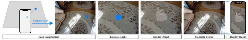
Fig. 2. Lighting estimation workflow in AR applications. Lighting estimation starts from a camera view captured by a user’s mobile phone camera. The captured photo, together with a screen coordinate (e.g., provided by the user through touch-screen), is then passed to a lighting estimation algorithm. The estimated lighting information is then used to render 3D objects, which are then combined with the original camera view into a 2D image frame.

model to tackle the view transformation and a compact deep learning model for point cloud-based lighting estimation. Our two-stage lighting estimation for mobile AR has the promise of realistic rendering effects and fast estimation speed.