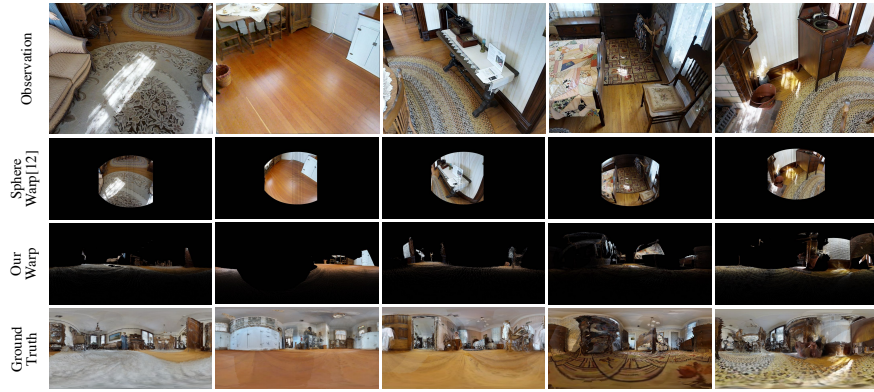
Fig. 4. Comparison of different warping methods. To transform mobile camera view spatially, i.e., from observation to rendering location, we leverage the point cloud which was generated from the RGB-D image. Our approach is not impacted by distortion and therefore is more accurate than spherical warping that only considers RGB image [12].