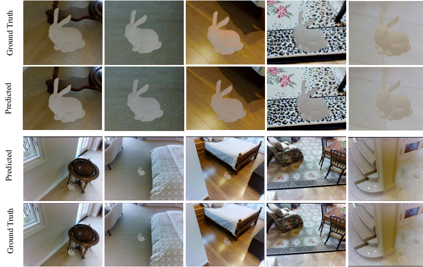
Fig. 7. Rendering example from PointAR. Comparison between rendering a 3D object with ground truth irradiance map and irradiance map generated by POINTAR. Row 1 and 2 show the comparison between a closeup look of the rendered objects. Row 3 and 4 show the comparison between rendered objects in original observations. Note we did not cast shadow to highlight lighting-related rendering effects to avoid misleading visual effects.

In this work, we leveraged both Matterport3D and the Neural Illumination datasets to generate a dataset that consists of point cloud data P and SH coefficients S . Each data entry is a five-item tuple represented as ((C, D), E, R, P, S) . However, training directly on the point clouds generated from observation images are very large, e.g., 1310720 points per observation image, which complicates model training with can be inefficient as each observation image contains 1310720 points, requiring large amount of GPU memory. In our current implementation, we uniformly down-sampled each point cloud to 1280 points to reduce resource consumption during training and inference. Our uniform down-sampling method is consistent with the one used in the PointConv paper [28]. Similar to what was demonstrated by Wu et al. [28], we also observed that reducing the point cloud size, i.e., the number of points, does not necessarily lead to worse prediction but can reduce GPU memory consumption linearly during training.