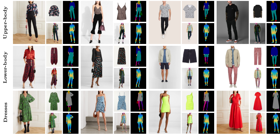
Fig. 2. Sample image pairs from the Dress Code dataset with pose keypoints, dense poses, and segmentation masks of human bodies.

A third direction of research estimates the person semantic layout to improve the visual quality of generated images [12,20,42,45]. In this context, Jandial et al. [20] proposed to generate a conditional segmentation mask to handle occlusions and complex body poses effectively. Very recently, Chen et al. [3] introduced a new scenario where the try-on results are synthesized in sequential poses with spatio-temporal smoothness. Using a recurrent approach, Cui et al. [5] designed a person generation framework for pose transfer, virtual try-on, and other fashion-related tasks. While almost all these methods generate low-resolution results, a limited subset of works focuses on the generation of higher-resolution images instead. Unfortunately, these works employ non-public datasets to train and test the proposed architectures [24,43].