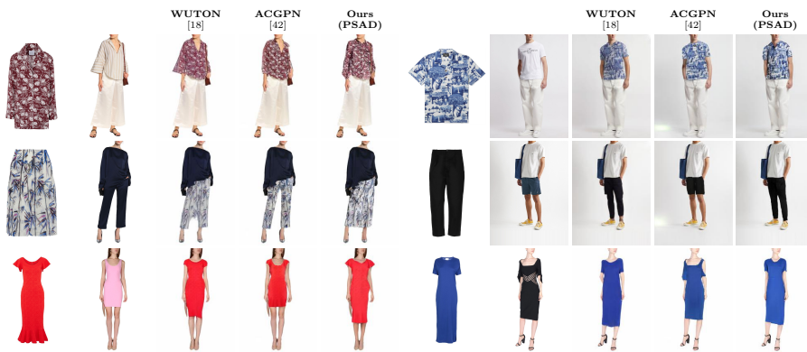
Fig. 5. Sample try-on results on the Dress Code test set.

by removing in our discriminator the N semantic channels and only keeping the real/fake one [37] (Binary), and a baseline trained without the adversarial loss (NoDisc).