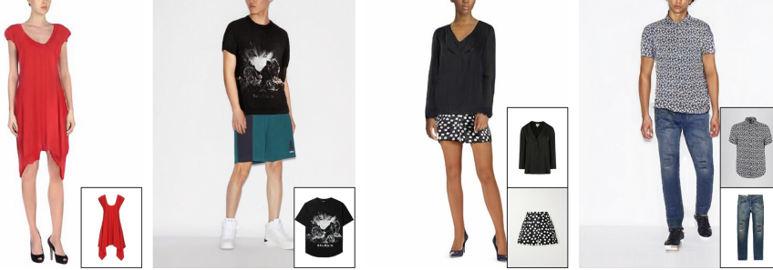
Fig. 6. High-resolution results on the Dress Code test set in both single- and multi-garment try-on settings.

different image resolutions, with the only exception of the IS metric. Notably, the improvement of PSAD with respect to the Patch baseline ranges from 2.34 to 5.00 and from 0.16 to 0.46 in terms of FID and KID respectively.