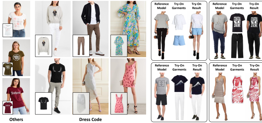
Fig. 1. Differently from existing publicly available datasets for virtual try-on, Dress Code features different garments, also belonging to lower-body and full-body categories, and high-resolution images.

the person’s intrinsic information such as body shape and pose should not be modified. Also, the try-on garment is expected to properly fit the person’s body while maintaining its original texture. All these elements make virtual try-on a very active and challenging research topic.