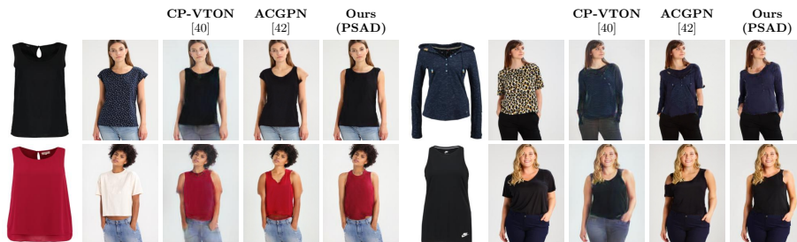
Fig. 7. Sample generated results on the VITON test set.

with other state-of-the-art architectures. In particular, we report results from CP-VTON [40] and CP-VTON+ [28] using source codes and pre-trained models provided by the authors. For SieveNet [20], ACGPN [42], and DCTON [9], we use the results reported in the papers. Table 6 shows the quantitative results on the test set, while in Fig. 7 we report four examples of the generated try-on results. Also in this setting, PSAD contributes to increasing the realism and visual quality of synthesized images.