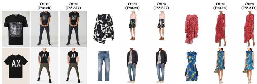
Fig. 4. Qualitative comparison between Patch and PSAD.