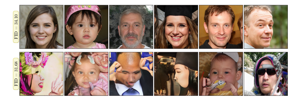
Fig. 3. Effect of attacking truncated StyleGANv2's latent space on the Fréchet Inception Distance (FID). We conduct attacks on the latent space of StyleGANv2 and record the effect on the FID. We display the resulting samples of these attacks for two truncation values, \alpha=0.7 (top row) and \alpha=1.0 (bottom row). Despite the stark differences in realism between the images in the top and bottom rows—i.e. the top row's remarkable quality and the bottom row's artifacts—the FID to FFHQ reverses this ranking, wherein the bottom row is judged as farther away from FFHQ than the top row.

Effect of Truncation on FID. We first assess the effect of the truncation level \alpha on both image quality and FID. We set \alpha \in [0.7, 1.0, 1.3] and find FIDs to be [21.81, 2.65, 9.31], respectively. Based on our results, we assert the following observation: while the visual quality of generated images at higher truncation levels, e.g. \alpha = 0.7 , is better and has fewer artifacts than the other \alpha values, the FID does not reflect this fact, showing lower (better) values for \alpha \in \{1.0, 1.3\} . We elaborate on this observation with qualitative experiments in the appendix.