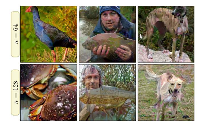
Fig. 4. Attacking R-FID with pixel perturbations. We attack two variants of R-FID ( \kappa = 64 and \kappa = 128 ) and visualize samples from the resulting datasets. Attempting to fool these R-FIDs at the pixel level yields perturbations that correlate with semantic patterns, in contrast to those obtained when attempting to fool the standard FID (as shown in Figure 1).