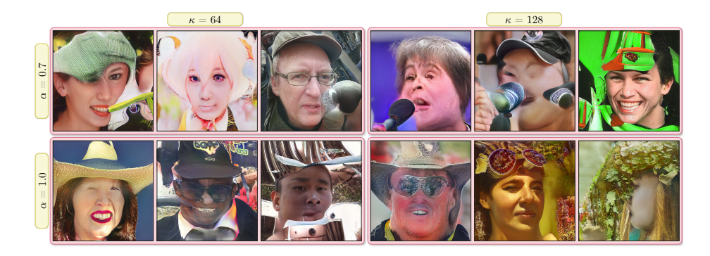
Fig. 5. Robustness of R-FID against perturbations in StyleGANv2 latent space. We conduct attacks on two variants of R-FID ( \kappa=64 on the left, and \kappa=128 on the right) and two truncation values ( \alpha=0.7 on the top, and \alpha=1.0 on the bottom) by perturbing the latent space. We also visualize samples from the generated distributions. For the pairs (\kappa,\alpha)\in\{(64,0.7),(64,1.0),(128,0.7),(128,1.0)\} , we find corresponding R-FID values of \{128.1,157.8,126.6,162.8\} . In contrast to the minimal changes required to fool the standard FID (Fig. 3), fooling the R-FID leads to a dramatic degradation in visual quality of the generated images.

distribution. We further evaluate if the R-FID is generally large between any two distributions by measuring the R-FID between two distributions of images generated at two truncation levels (\alpha_i, \alpha_j) . Table 3 reports these results. We observe that (i) the R-FID between a distribution and itself is \approx 0 , e.g. R-FID = 10^{-3} at (1.0, 1.0). Please refer to the appendix for details. (ii) The R-FID gradually increases as the image distributions differ, e.g. R-FID at (0.9, 1.0) < (0.7, 1.0). This observation validates that the large R-FID values found between FFHQ and various truncation levels are a result of the large separation in the embedding space that robust models induce between real and generated images.