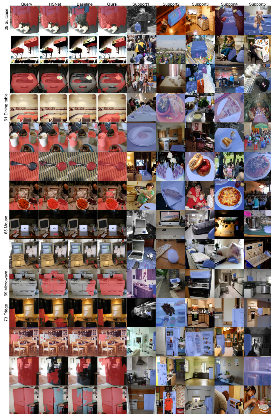
Fig. 2. Recognition results of 29 suitcase, 61 dining table, 65 mouse, 69 microwave and 73 fridge in s-0. They experiment with ResNet-50 5shot setting on COCO-20 i .