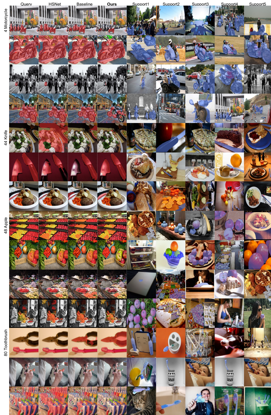
Fig. 5. Recognition results of 4 motorcycle, 44 knife, 48 apple and 80 toothbrush in s-3. They experiment with ResNet-50 5shot setting on COCO-20 i .