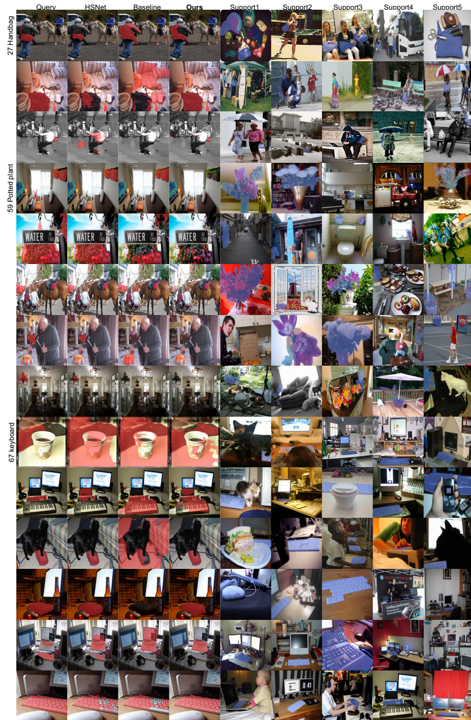
Fig. 4. Recognition results of 27 handbag, 59 potted plant and 67 keyboard in s-2. They experiment with ResNet-50 5shot setting on COCO-20 i .