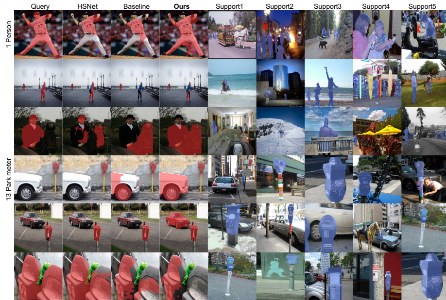
Fig. 1. Recognition results of 1 person and 13 park meter in s-0. They experiment with ResNet-50 5shot setting on COCO-20 i .

We additionally show the recognition results of all splits. They are using our proposed method, baseline and HSNet. The red shade is the area of the target class. It is the ground truth in the case of query and the recognition result in the cases of HSNet, baseline and ours. The blue shade is the ground truth area in the case of support.